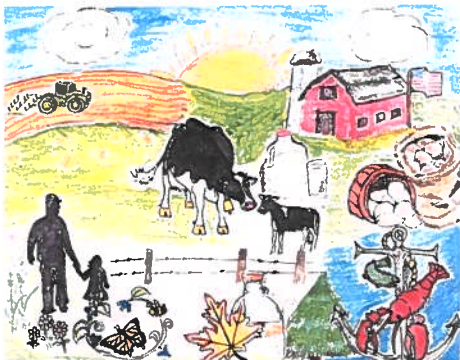
2018 Poster Contest Runner-up submission