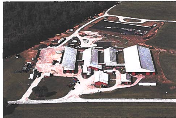
Aerial view of Misty Meadows Farm in Clinton, Maine